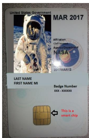
NASA Civil Servant PIV Badge